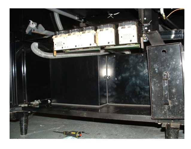
COMPLETE INSTALL BY ATTACHING LEFT PANEL FILTER HOUSING

FOR MORE INFORMATION ON THIS OR ANY OTHER CONVERSION USING THE GRS-2100 SYSTEM CALL: