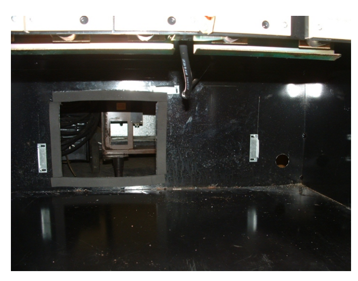
INSTALL GUIDE BRACKETS AND CABINET SEAL TO REAR WALL