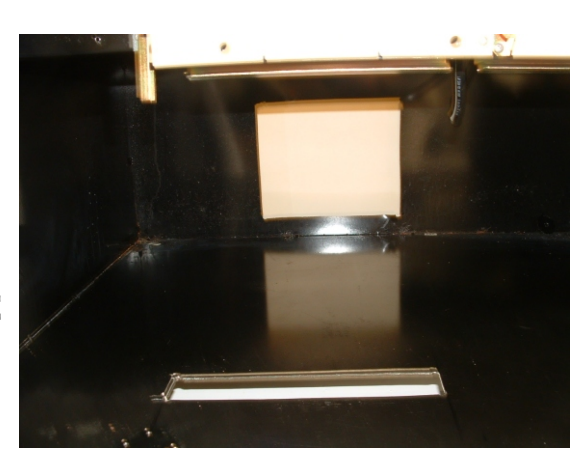
CUTOUT AIR INLET AND OUTLET IN BOTTOM AND BACK OF MACHINE.