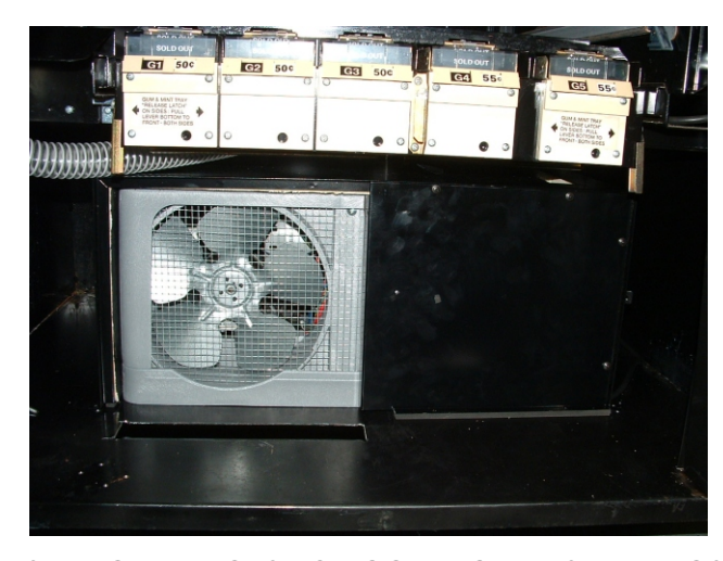
INSTALL OUTER HOUSING, CONNECT AIR SUPPLY HOSE, INSERT CUBE AND CONNECT POWER SUPPLY. INSTALL RIGHT SIDE PANEL.